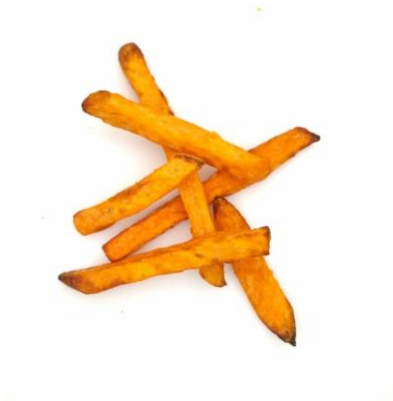
Oven baked product